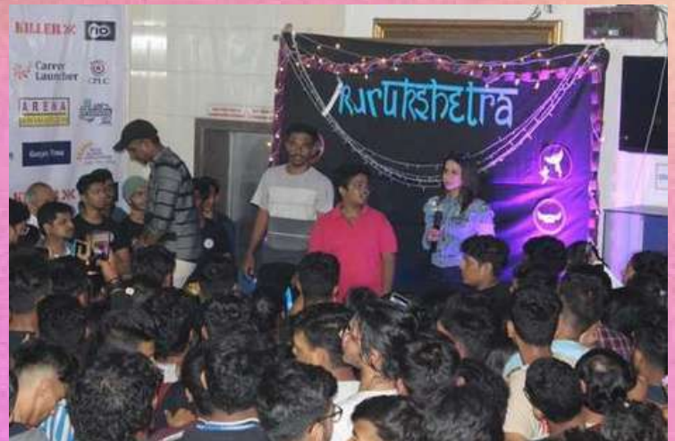
Actress Shreya Bugade dancing on the famous song Chandra with college students

Who doesn't like to dance be it the posh Waltz, the elegant Ballet, upbeat Hip hop or just the regular Ganpati Visarjan dance or popularly known as the wedding street dance. ABCD Any body can dance. Distributed into further subevents like Street dance or the Solo/Duet or the group dance. It always takes the cake when capturing the audience.