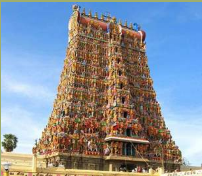
( https://img.traveltriangle.com/blog/wp-content/uploads/2018/05/essential-info.jpg )

One of the most visited temples of the south, The Meenakshi temple isn't just a religious place but a marvel filled with the history of India's art and architecture. The temple is dedicated to Goddess Meenakshi and receives more than 10,000 devotees everyday and even more in the special Chithirai Festival, also known as Chithirai Thiruvizha, Meenakshi Kalyanam or Meenakshi Thirukalyanam, which is an annual Tamil Hindu celebration during the month of April. A place unlike any other this 2500 years old temple is one of the most complex structures mankind has seen. The Meenakshi Temple has a pond called 'Porthamarai Kulam' or 'The Golden Lotus Pond' in its complex as the pond has lotus which has golden hue.