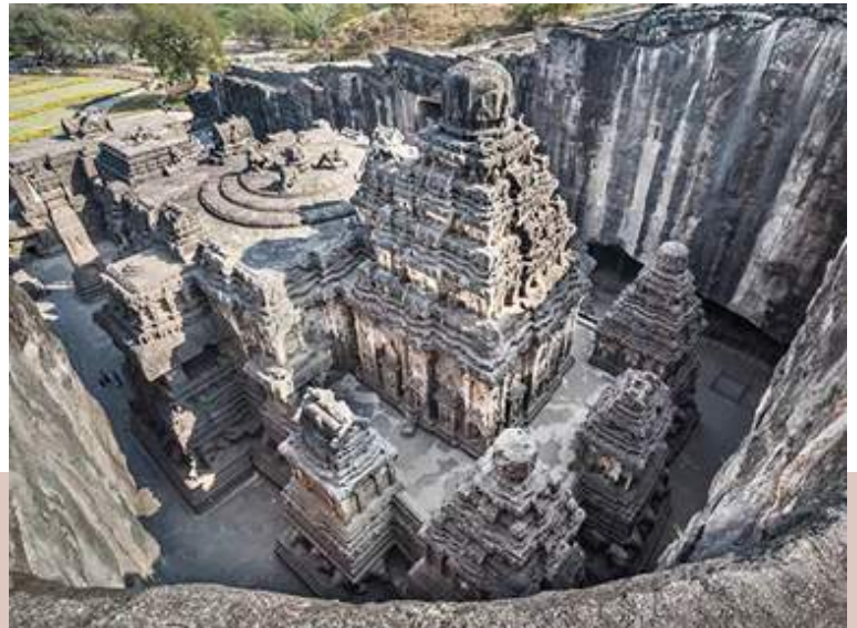
( https://img.etimg.com/thumb/msid-62660530,width-640,resizemode-4,imgsize-459458/ajanta-and-ellora-caves.jpg )

If you are one in search of India's history the Sindhudurg fort is one for you. Filled with stories of valor it is located at half a kilometer away from the Malvan fort in the Sindhudurg district and was built in the waters of the sea it is also known as the Fort of the Sea. This fort was the Naval headquarters of the Marathas. Chhatrapati Shivaji Maharaj built this fort to safeguard the marine border from the northern rule it took three years along with 100 Portuguese architects and 3000 work force. One can travel by boat to the fort then entering through the Dilli Darwaja also known as the main gate because to the clever architecture the Darwaja is only visible when one goes close to the forts otherwise seeming a part of the walls. Apart from the fort one can also visit the Tarkarli Beach known for its water sports activities and taste the amazing Malvani cuisine.