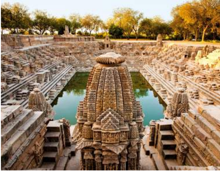
( https://www.outlookindia.com/outlooktraveller//public/uploads/2018/07/Sun-Temple-Kund-Modhera-Gujarat.jpg )