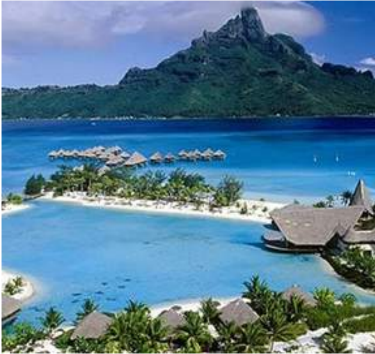
( https://dynamic-media-cdn.tripadvisor.com/media/photo-o/0e/21/2b/15/4-night-andaman-islands.jpg?w=500&h=300&s=1 )