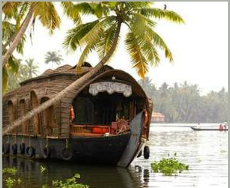
( https://media-cdn.tripadvisor.com/media/photo-s/1a/5a/71/4e/caption.jpg )

Kerela, the southern state of India and when one thinks of Kerela the first image that shows up in our minds are tasty coconuts, beaches and peaceful backwaters. One such place is the Alleppey known for its backwaters and houseboats you can stay overnights in such boats and enjoy the pleasant beauty of the place. And while there one cannot simply miss the houseboat cruises along the Vembanad Lake.