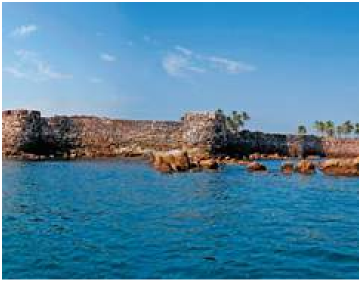
( https://www.mtdc.co.in/wp-content/uploads/2019/11/1535608811-sindhudurg-fort.jpg )