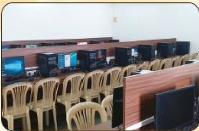
Computer Laboratory 3