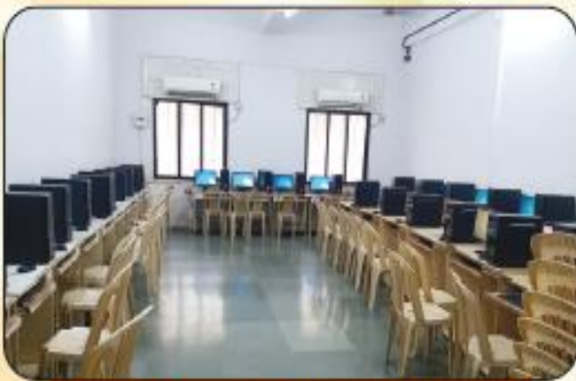
Computer Laboratory 1