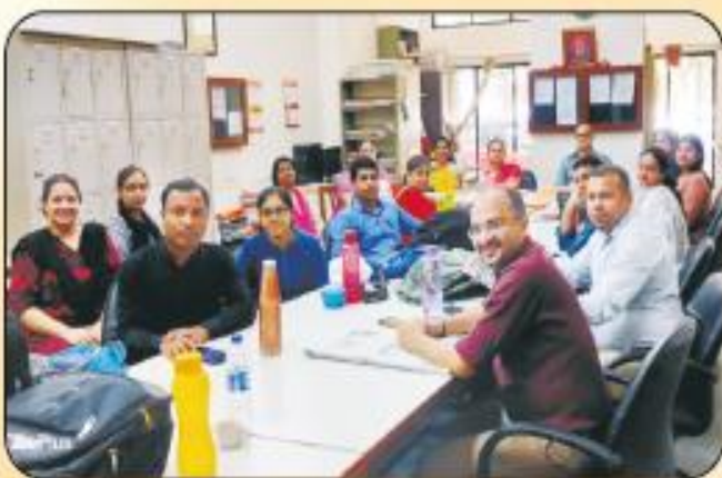
Staffroom (Aided Section)