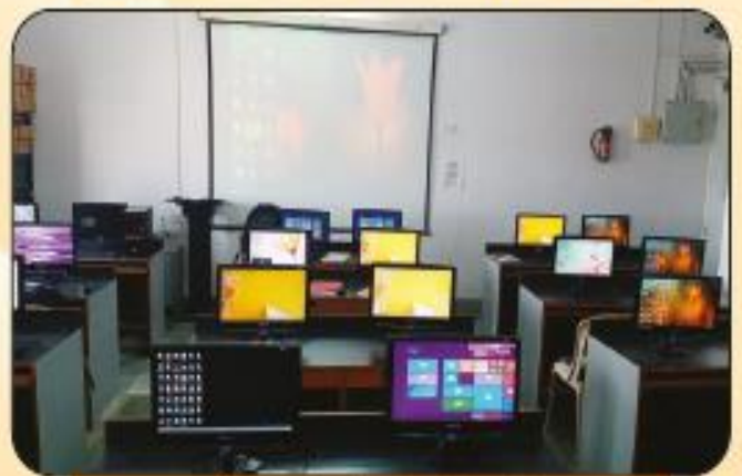
Computer Laboratory 4