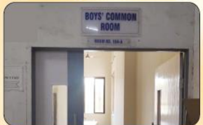
Boys Common Room