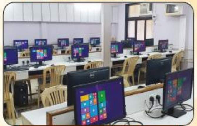
Computer Laboratory 2