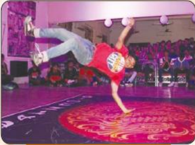
DAHANUKAR DANCING DUDES (D4)